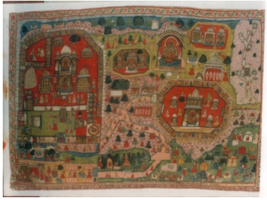
Figure 6: Calculated frequency evolution of modes detected in the BLS spectra.

In Fig. 6 the calculated frequencies of the most representative eigenmodes at +500 Oe (FM state) and - 500 Oe (AP state) are plotted as a function of the gap size d between the Py and Co sub units (please remind that in the real sample studied here, d = 35 nm). As a general comment, it can be seen that the frequencies for the system in the AP state are more sensitive to d than those of the P state. In particular, the lowest three frequency modes of the AP state (EM(Co), EM(Py) and F(Py)) are downshifted with respect to the case of isolated elements (dotted lines) and show a marked decrease with reducing d , while the two modes at higher frequencies (F(Co) and IDE(Py)) have an opposite behavior even though they exhibit a reduced amplitude. In the P state (right panel), the modes concentrated into the Py dots exhibit a moderate decrease with reducing d , while an opposite but less pronounced behavior is exhibited by the F(Co) mode.