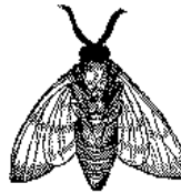
Figure 2: A sample black and white graphic that has been resized with the includegraphics command.

the page nearest their initial cite. To ensure this proper “floating” placement of figures, use the environment figure to enclose the figure and its caption.