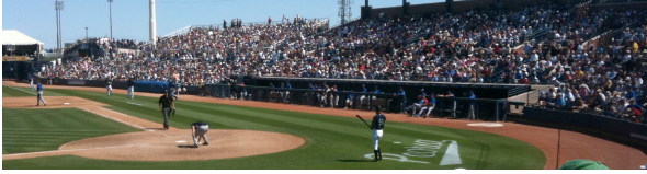
Figure 1: MOKE hysteresis loop for the bi-component Py/Co dots array measured along the dots long axis.

magnetic elements with different shape and lateral dimensions [1–3]. This interest has been further renewed by the emergence of the spin-transfer torque effect, where a spin-polarized current can drive microwave frequency dynamics of such magnetic elements into steady-state precessional oscillations. Moreover, the knowledge of the magnetic eigenmodes is very important also from a fundamental point of view for probing the intrinsic dynamic properties of the nanoparticles. Besides, dense arrays of magnetic elements have been extensively studied in the field of Magnonic Crystals (MCs), that is magnetic media with periodic modulation of the magnetic parameters, for their capability to support the propagation of collective spin waves [4,5]. It has been demonstrated that in MCs the spin wave dispersion is characterized by magnonic band gaps, i.e. a similar feature was already found in simple two-dimensional lattices with equal elements like